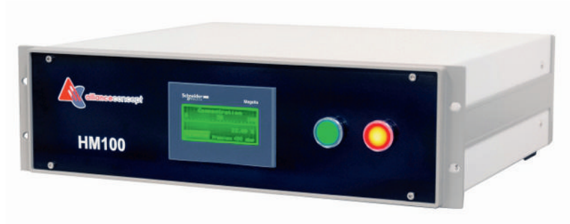
HM100, our brand-new helium concentration measurement system